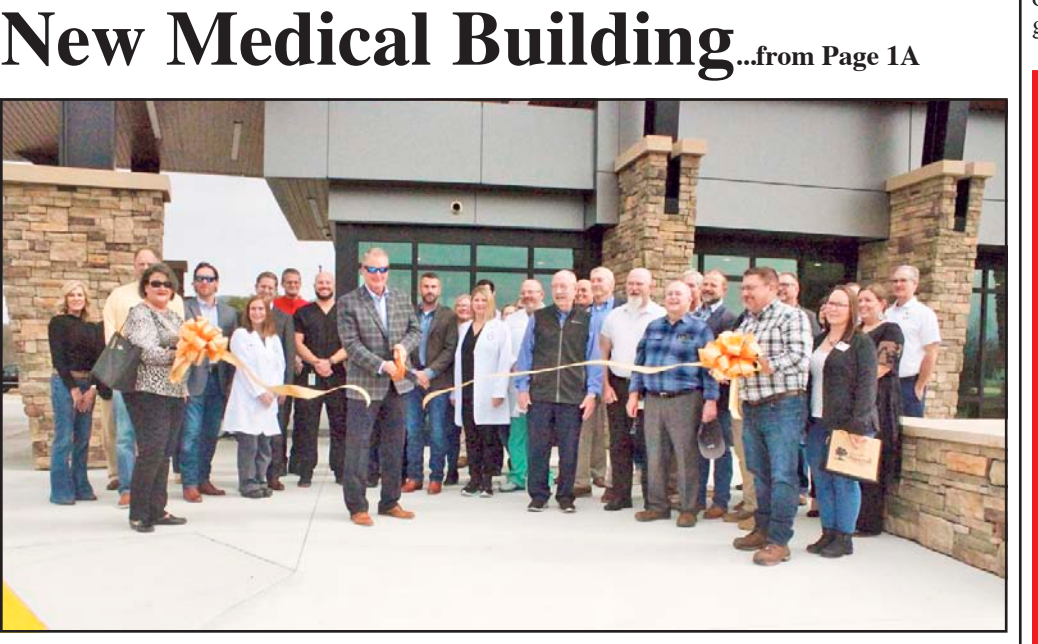
Union General Hospital cut the ribbon for its new Medical Office Building on Friday, welcoming local officials and members of the public to the event.